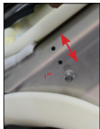
BACK PIN POSITIONS ADJUSTABLE HOLES

Accommodates Pelvic rotation and will allow for full back support with 25 degrees of posterior and 20 degrees of anterior adjustability.