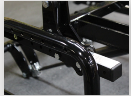
Rear Depth Adjustable Frame