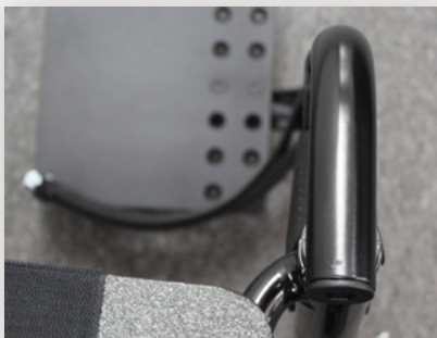
Center Pivot Swing In And Swing Out Front Rigging (Optional)