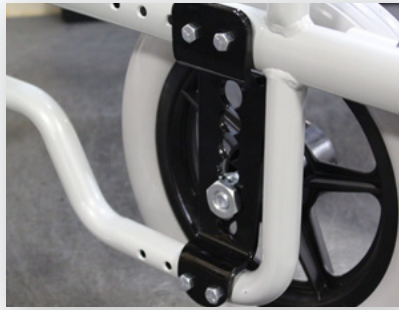
Rear Axle Adjustability